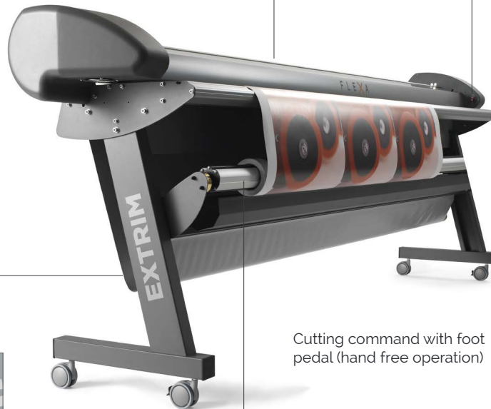
Cutting command with foot pedal (hand free operation)