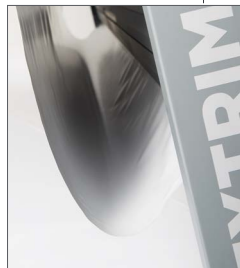
Waste catcher to keep the working area clean and neat