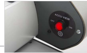
Accu View precision cutting system