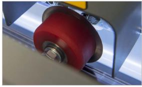
Self-sharpening circular blade for a long term reliability and no service costs