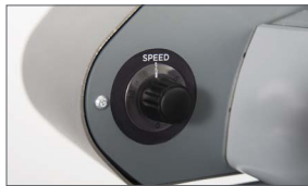
Adjustable cutting speed regulator (max. 100 m/min.)