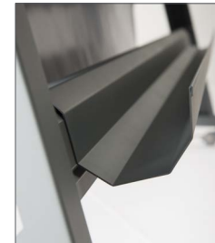
Collecting tray for prints (optional)