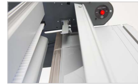
Automatic lowered pressure bars to hold the material in place while cutting